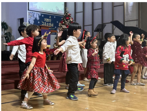
Photographed by: DAISY DONG (11)