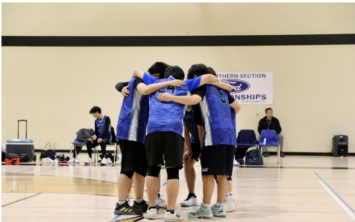
Photograph by: Chaewon Wi (11)