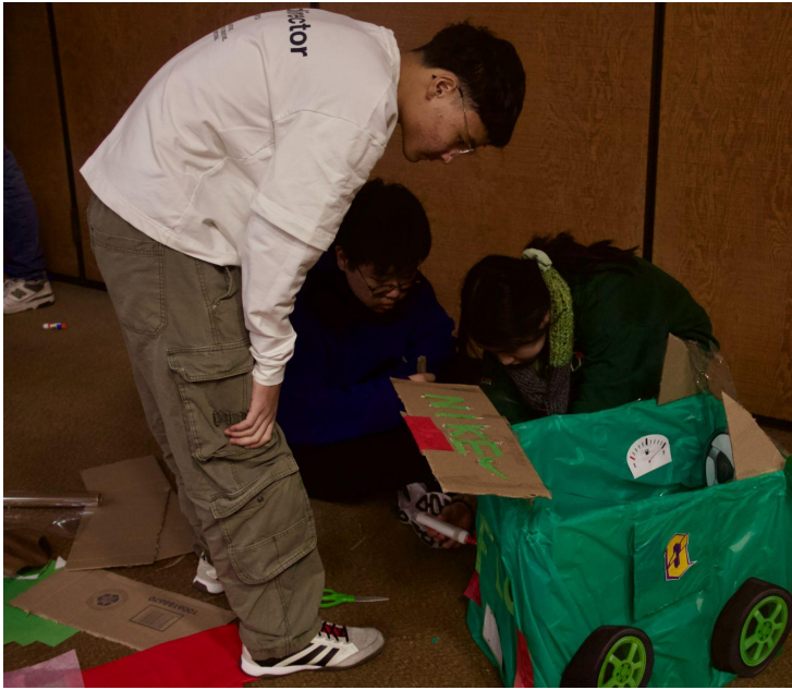
Photograph by: Daisy Dong (12)